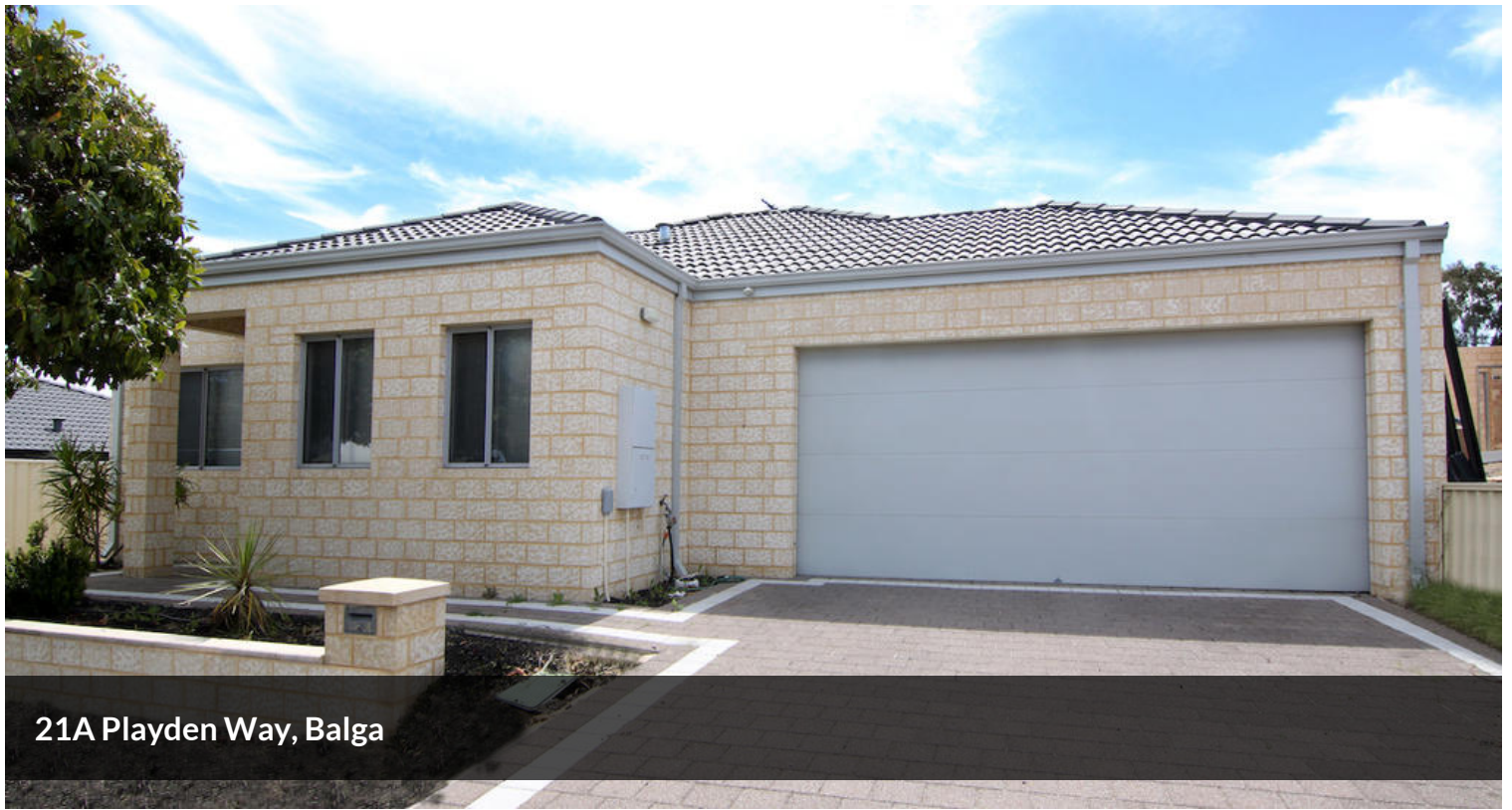
21A Playden Way, Balga